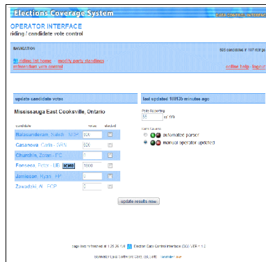
Ridings and Candidates